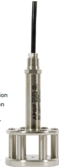
*Shown with anti-snag cage.

Note: ▲ Indicates this option is standard.